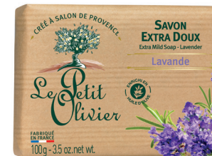
Extra Mild Soap Bar Lavender 100 g