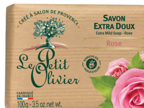
Extra Mild Soap Bar Rose 100 g