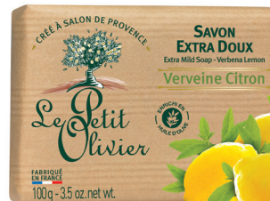
Extra Mild Soap Bar Verbena Lemon 100 g